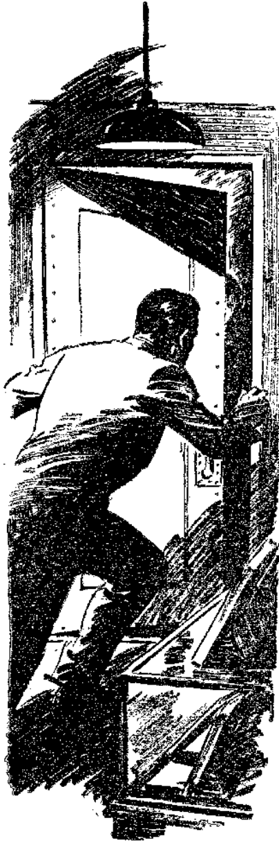
"Cranston was a few feet short of the door when it clanged shut."

hadn't expected this visitor, Weston said that he would see him, so the professor was shown into the commissioner's presence.