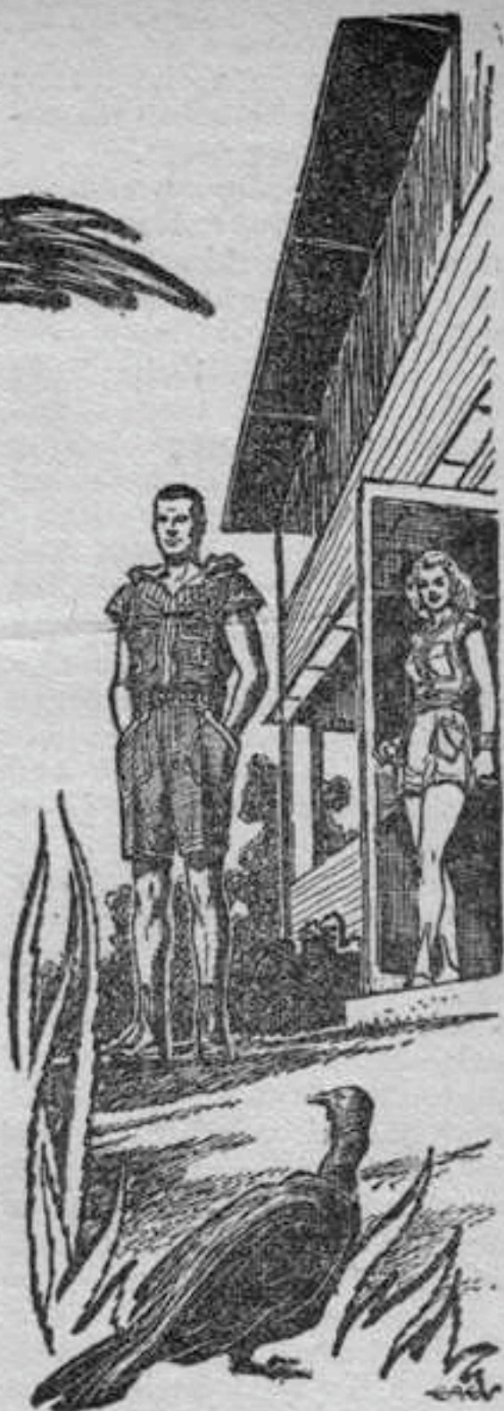
Karol came out as the piranya bird played the coquette.

The piranya female made one too-aggressive advance, and her suitor fled back into the brush from which he had come. She returned to her brooding mate and began her dance in front of him. He